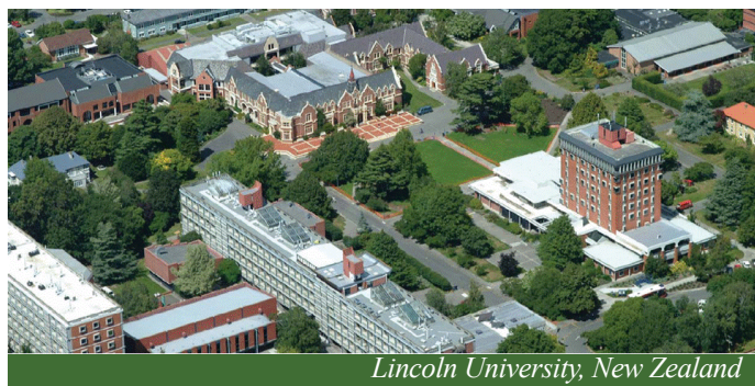
Lincoln University, New Zealand

www.tec.govt.nz/templates/standard.aspx?id=1183