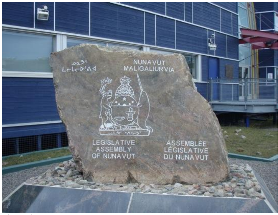
Figure 2. Stone designating Nunavut Legislative Assembly building, Iqualit